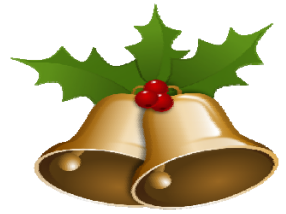
Images from keyboard concert & nursing home carols