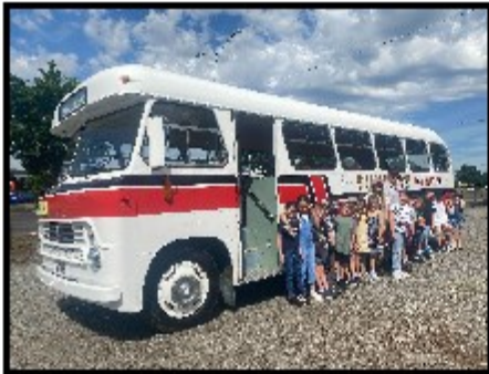
tour. All of the Grade 2s went on the bus. 2J in front of the old Sunbury Coaches bus.

On the 2nd of December, 2021, for a Life and Faith excursion, we went on an old bus