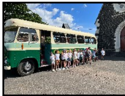
2A in front of the old Sunbury Coaches bus.

It took us 30 minutes to travel around Sunbury.