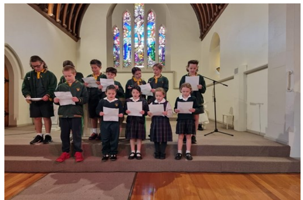
Some members read the pledge at mass