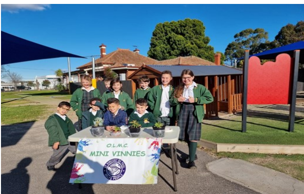
The Mini Vinnies selling plants to raise money

We try our best to follow the Mini Vinnies motto of 'See, think, do' and offer to work around the school and help take care of the gardens.