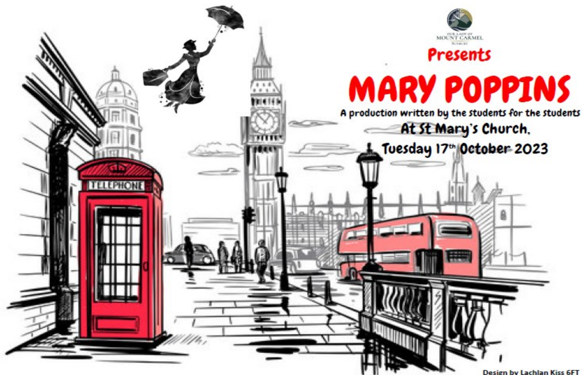
Design by Lachlan Kiss 6FT