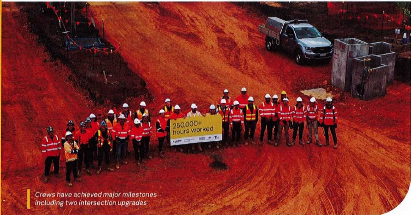
Crews have achieved major milestones including two intersection upgrades