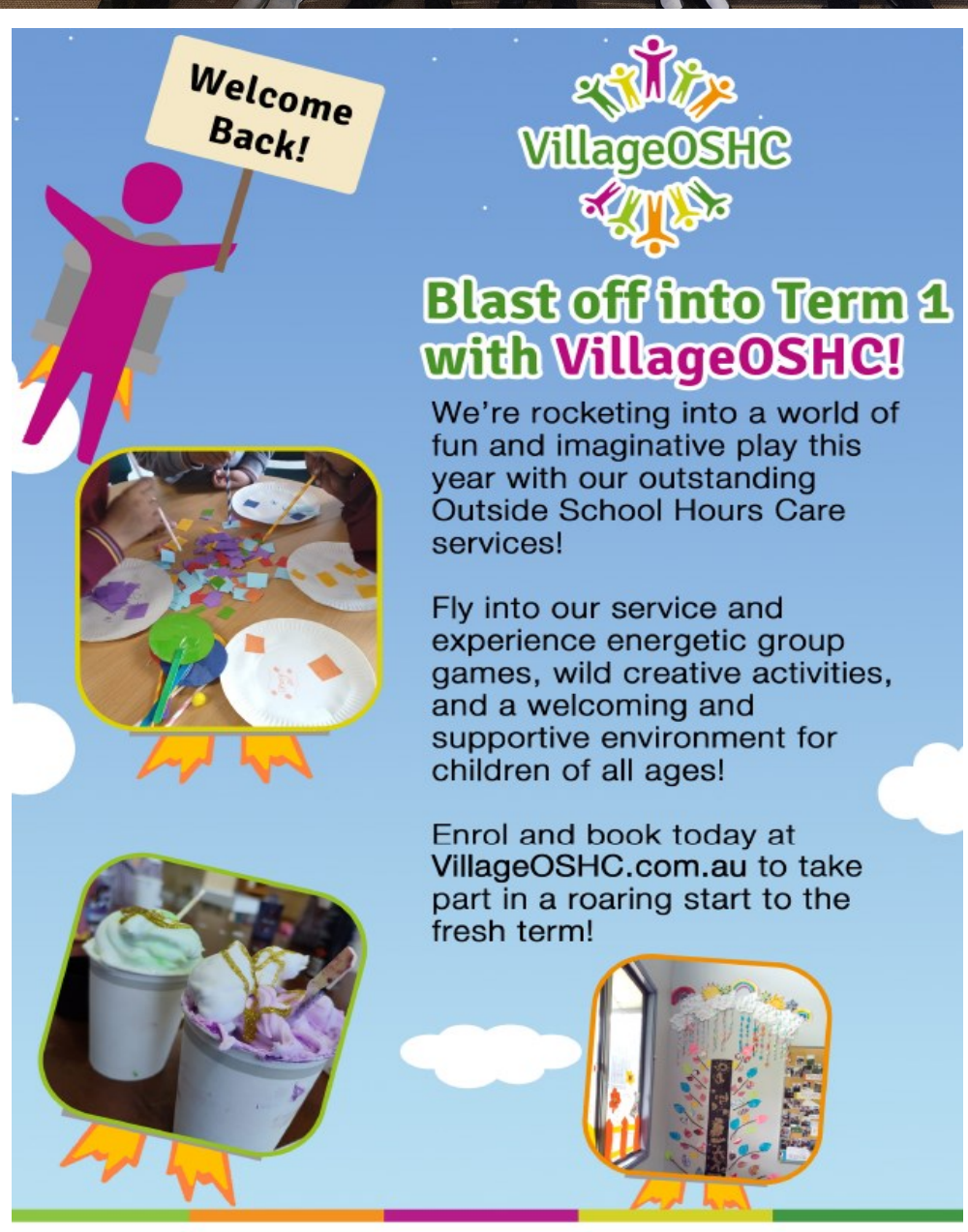
Visit VillageOSHC.com.au and reach new heights!